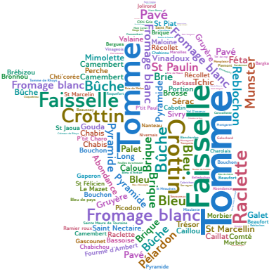
Figure 5: Allowed rotations based on size of words with smaller words having more allowed rotations.

We can aim to combine the positive effects of fewer and of more rotation options by restricting the rotations based on the importance of a word. Fig. 5 shows such a word cloud: the biggest 10 words are orthogonal, 40% use 45°rotations and all remaining words 10°.