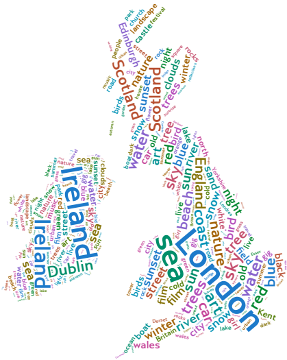
Figure 8: Geo word cloud of Flickr tags in Great Britain and Ireland after manually merging the countries (rotations of 10 degrees).

Fig. 2 shows geo word clouds where the relative scaling between Great Britain and Ireland is maintained. Here Ireland is sparsely filled, because the data set contains less points for Ireland. We could extend the algorithm to scale words relative to the area of their component instead of to the complete map (see Fig. 8). We could also combine our approach with contiguous area cartograms [7], to distort regions to match the required size.