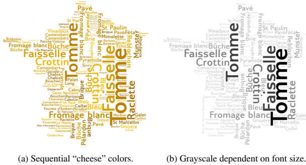
Figure 3: Geo word clouds of France: different color maps.