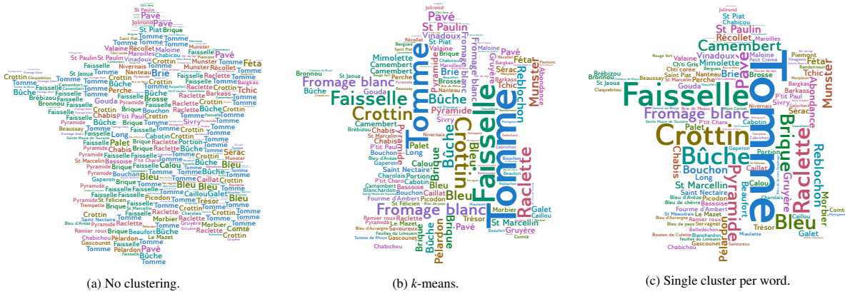
Figure 6: Geo word clouds of French cheeses: extreme cases for clustering.

bigger, the words will have a larger font size, making them harder for words of similar size to stack nicely and fill up the map.