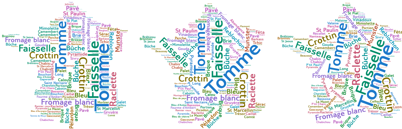
Figure 1: Geo word clouds of cheese production in France (left: orthogonal, middle: 45 degrees, right: 10 degrees).

Jules Wulms¶ TU Eindhoven, The Netherlands